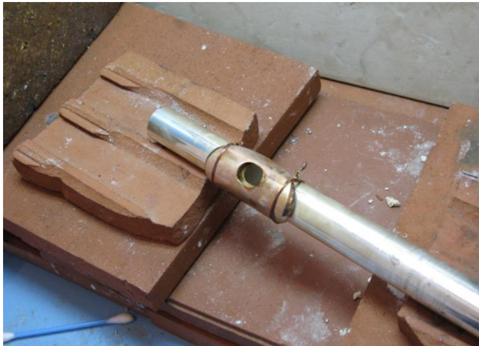
Cooper rebuild - lip-plate soldered to the tube