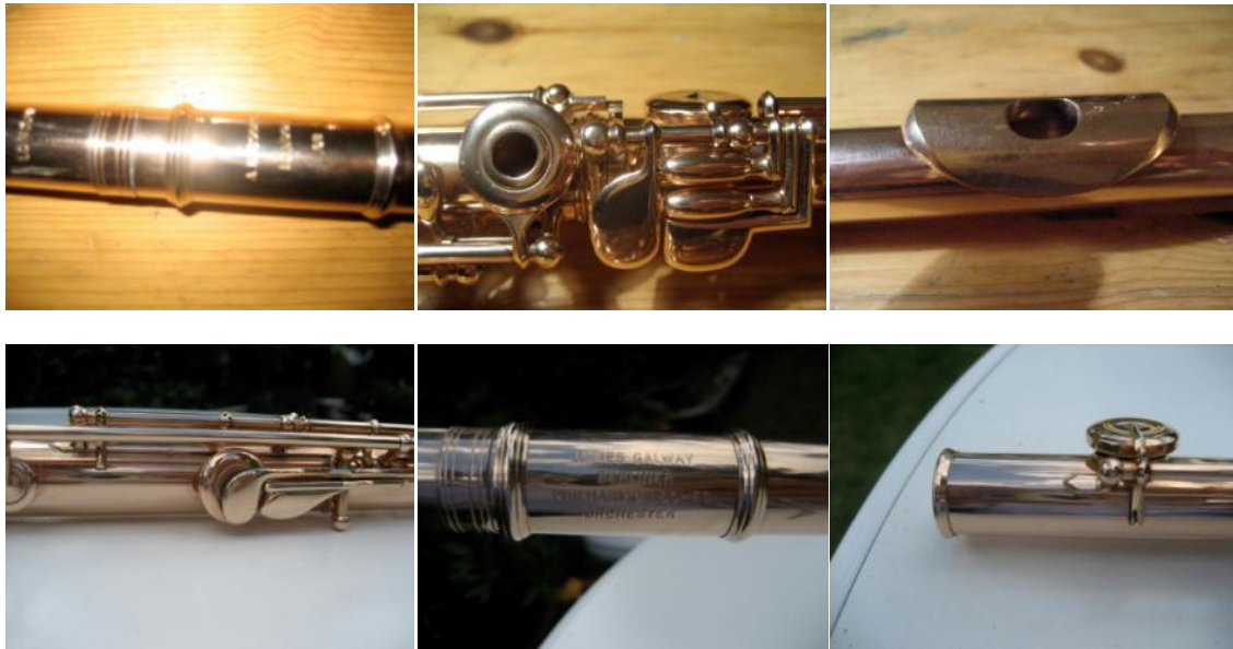
'Berlin Philharmonic' Cooper

Click here to view these and more images at a full scale